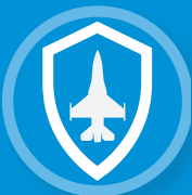
AVIATION DEFENSE SPACE