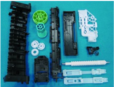
Injection Molded Plastic Examples